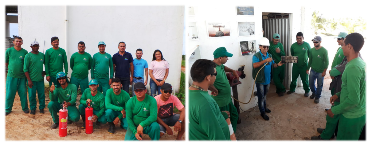
Regular trainings keep our employees safe and help them develop knowledge to best perform their duties and improve their skills beyond their job

To ensure the safety of our plantation workers, our employees receive constant training on how to properly handle and operate equipment from fire extinguishers to heavy machinery. Primal Group believes in providing employees with the best tools and information so that they enjoy a safe work environment where they can perform their duties to the best of their abilities.