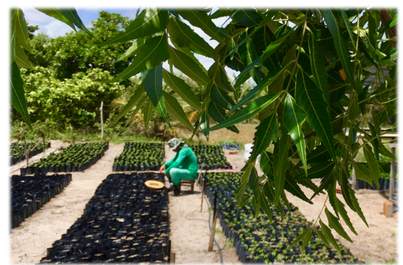
Organic techniques nourish our project in the healthiest and most productive way possible

Sustainability is about knowing the value that every ecosystem has. Every part of our process involves making sure that we balance the ecosystem through proper nutrition which is key for the promotion of microorganisms. We achieve this through the use of innovative techniques and state of the art technology, such as: