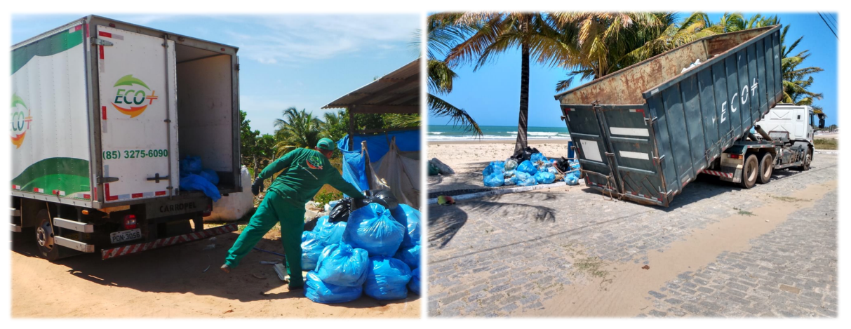
30,000 cubic meters of waste collected from our plantation will be recycled and converted into new materials

In 2019, we have recollected 30,000 cubic meters of waste, which are being processed to convert them into new materials and objects.