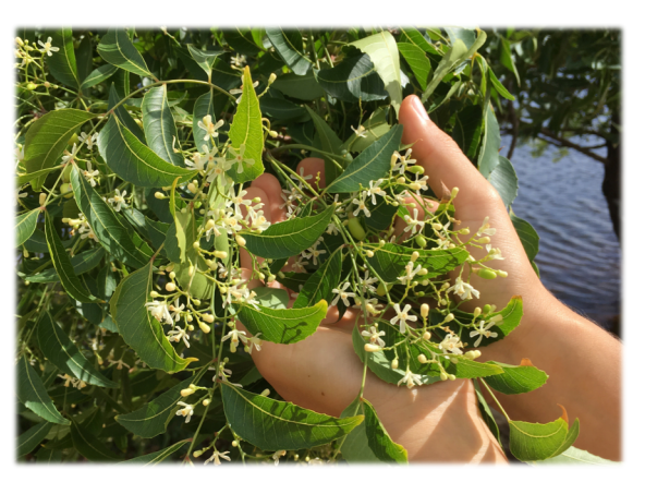
Neem is a solution to a variety of ailments

With over 200 compounds proven to be effective against cancer, malaria, diabetes, inflammation, infection, fever, influenza, skin disease and dental illness, neem is a solution to a variety of ailments. Over the past twenty years, major institutions have published several thousand papers exploring the plant's effectiveness as a natural medicine.