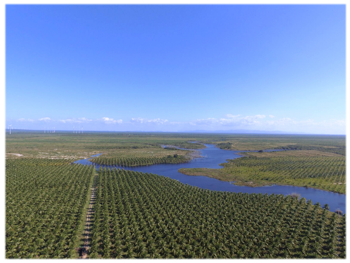
Our project aims to build an entirely new agricultural system based on safe, innovative and regenerative best practices

The archaic system of the current industry needs to be transformed into one that guarantees the needs of all are met in a safe and sustainable way. At Primal, we believe the neem tree, as a crop care solution that delivers effective protection and high yields without harming the environment or human health, has the power to transform the future of agriculture and food production. This unique resource offers natural and innovative solutions where they are needed the most – across agriculture, healthcare, and environmental protection.