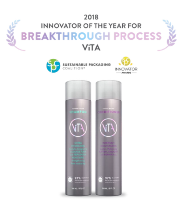
Every ViTA bottle sold prevents a bottle of the same size from floating in the ocean

On a global scale, we are tackling plastic waste by revolutionizing the beauty and personal care industry through our brand ViTA sustainably and its driven packaging. ViTA's bottles are the world's first and currently only bottles to be made entirely from 100% OceanBound recycled OceanBound plastic. plastic. sourced through our packaging partners Envision Plastics. is defined as plastic found in highrisk coastal areas where there is no formal collection system and plastic waste is most likely to enter and pollute the ocean. With each ViTA bottle sold we are preventing a plastic bottle of the same size from floating in the ocean. ViTA