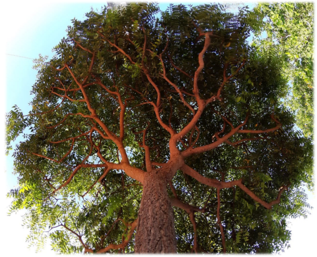
Adult neem tree

The neem tree (Azadirachta Indica) is a fast-growing species, which grows about 2.6 feet (80cm) every year and can reach up to 100 feet (30 meters) when fullv arown. The scientific interest in the tree started in the 1950s. much of it centered on the oil from the fruit. One of its main active ingredients from the more compounds than 250 is azadirachtin, which has а complex chemical structure that provides much of neem's potency and unique anti-