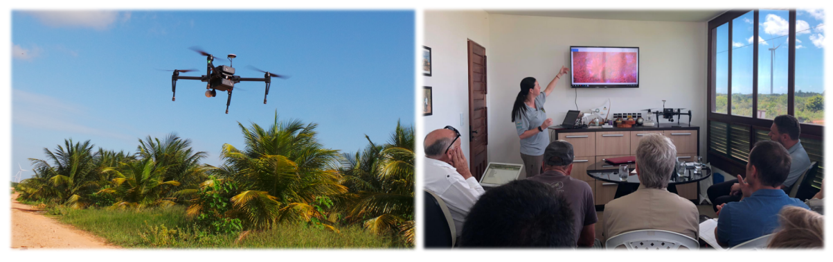
Drone technology and AG tech like Precision Mapper allow us to analyze various field metrics and reduce the use of organic inputs