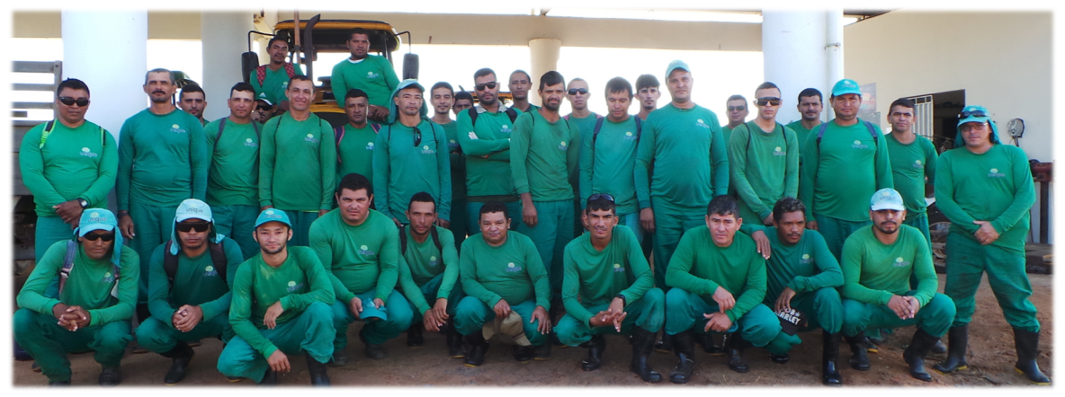
We constantly strive to go beyond the traditional company-employee relationship and inspire our employees to help us disrupt current business models

Our corporate values and the ten UN Global Compact principles set out the framework for our business conduct and our sustainability efforts. Over the course of this year we have made significant progress in fulfilling our Sustainable Development targets, as we continue to revolutionize the agricultural industry and business world.