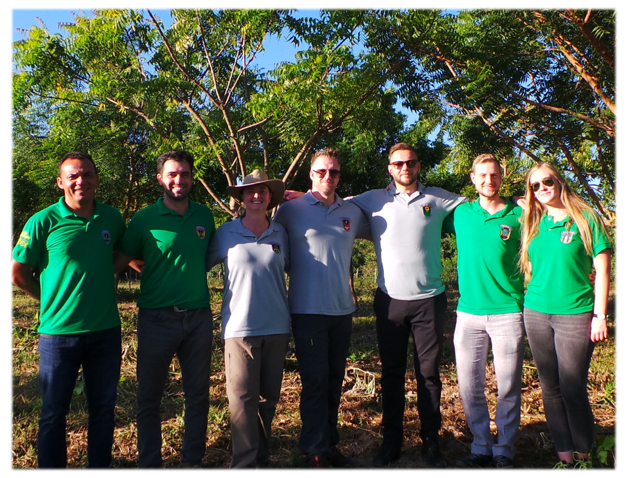
Our management team strives to ensure both the permanence of natural capital and globally competitive yields

assisted by the latest technology, we are ushering a new era for agriculture; one that guarantees higher yields by nurturing the soil and the surrounding ecosystems. Our agricultural project has been joined by our natural, neem-based beauty and personal care brand, ViTA. Using the world's first and currently only 100% OceanBound recycled bottles, made from plastic found in high-risk coastal areas where plastic waste is most likely to pollute the ocean, ViTA is playing a lead role in keeping the oceans plastic-free. At the intersection of sustainability and technology, we are constantly on the lookout for new business models that can satisfy the most fundamental requirements for life and secure a safe and prosperous future for us all - be it in the agriculture or the beauty industry, we believe the only way forward is through social and environmental responsibility.