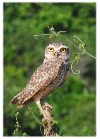
The burrowing owl is an endangered species

Additionally, the 40km/h speed limit on our plantation ensures small reptiles and birds are not run over.