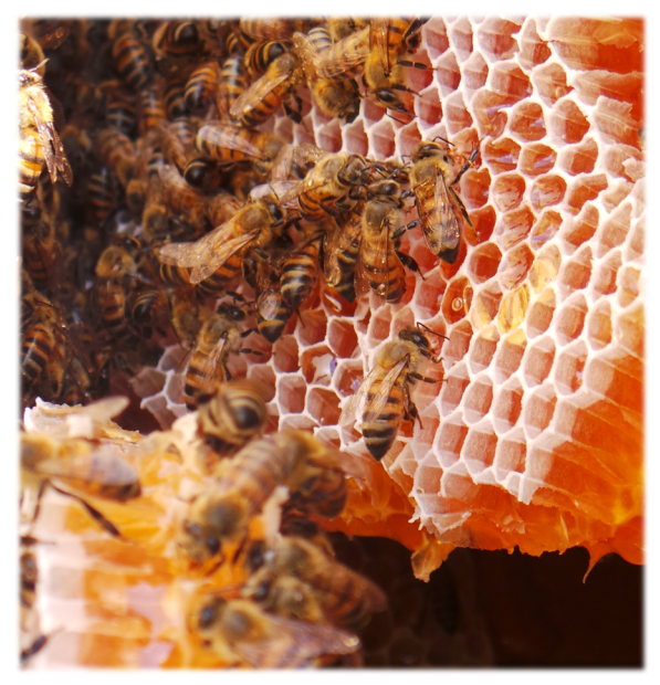
This season we harvested 1000 kgs of delicious honey

After a very productive rainy season, our bees have had more than enough flowers to feed on and create beautifully rich and delicious neem honey, which we have recently harvested. This season we were able to collect 1000 kg of honey, and we continue to be part of an alliance of 48 honey producers from all across Ceara.