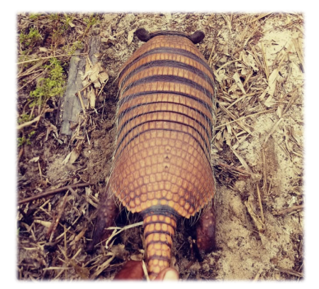
We were delighted to spot an armadillo on our plantation

Thanks to our wildlife protection policies, our plantation provides a shelter for a variety of different animals like armadillos, owls and snakes. Our environmental protection policies are at the very core of everything we do and aim to benefit the environment, the local community and our company, as well as create awareness of world's environmental problems and how sustainable practices can tackle them.