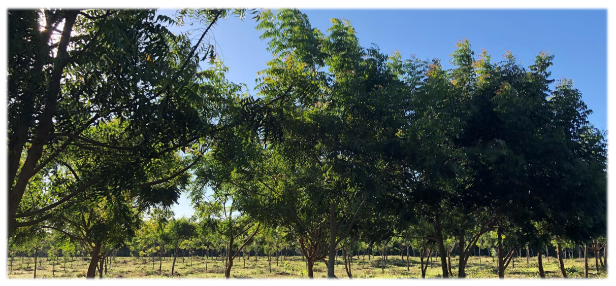
Our project aims to build an entirely new agricultural system based on safe, innovative and regenerative best practices

In the age of climate change, planting more trees worldwide is a practical way to cleanse our environment through long-term carbon entrapment. For those examining the benefits of planting trees, neem trees tick many of the boxes for its suitability. A hardy, drought resistant tree, with a thick foliage, very high leaf surface area and wide canopy, neem has the capability to provide a shield against other pollution components, with a sequestration capacity of 12.27 tons