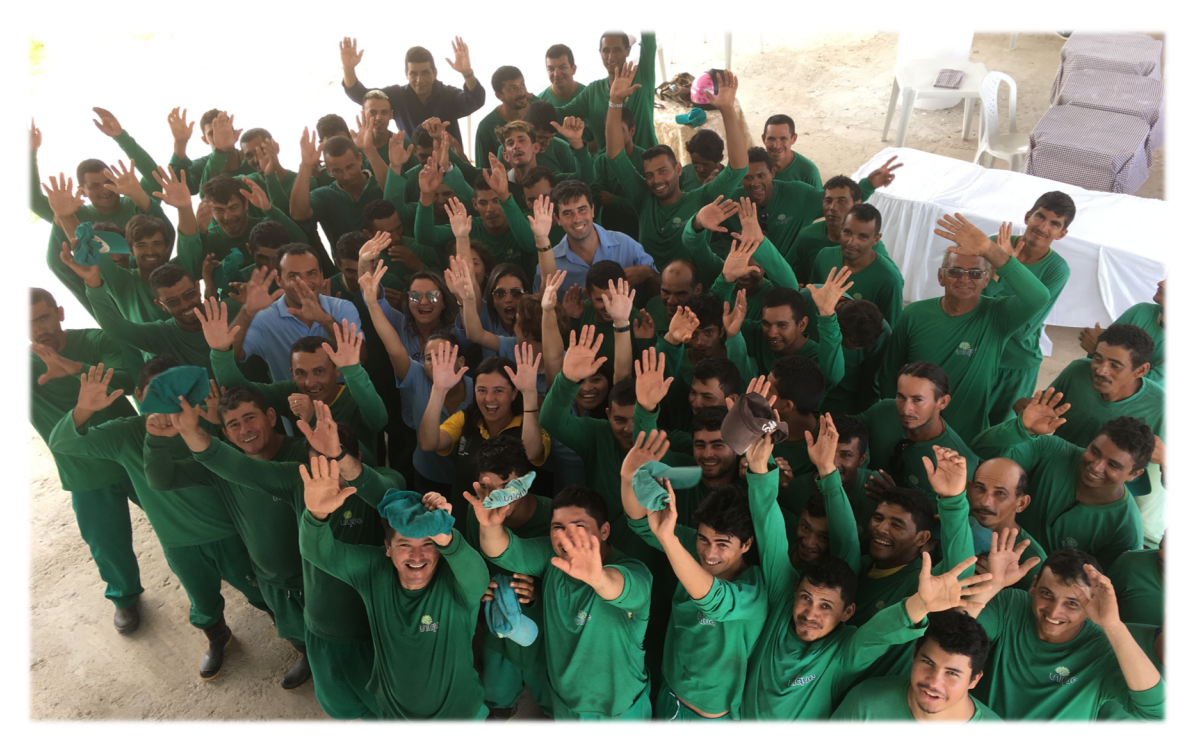
Corruption prevents communities from rising out of poverty, hampers competition and the enforcement of sustainable policies. This is the reason why we are committed towards practices that deter corruption in our company and the local communities we engage in