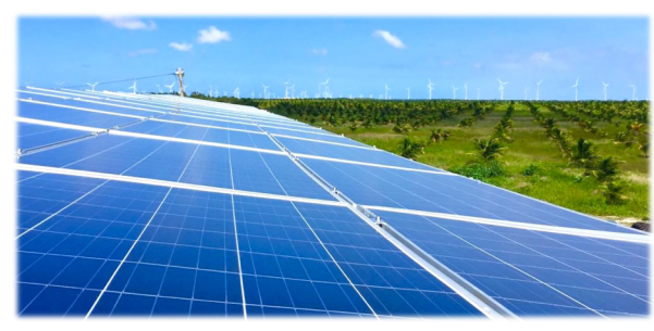
We plan to meet our energy demands entirely through renewable means

Our solar panels have generated 29.5 megawatt hours (MWh) to date, offsetting 26.28 metric tons of carbon, the offset equivalent of 5.6 acres of pine forest. In the future we intend to utilize 100% clean and renewable energy on our agricultural projects.