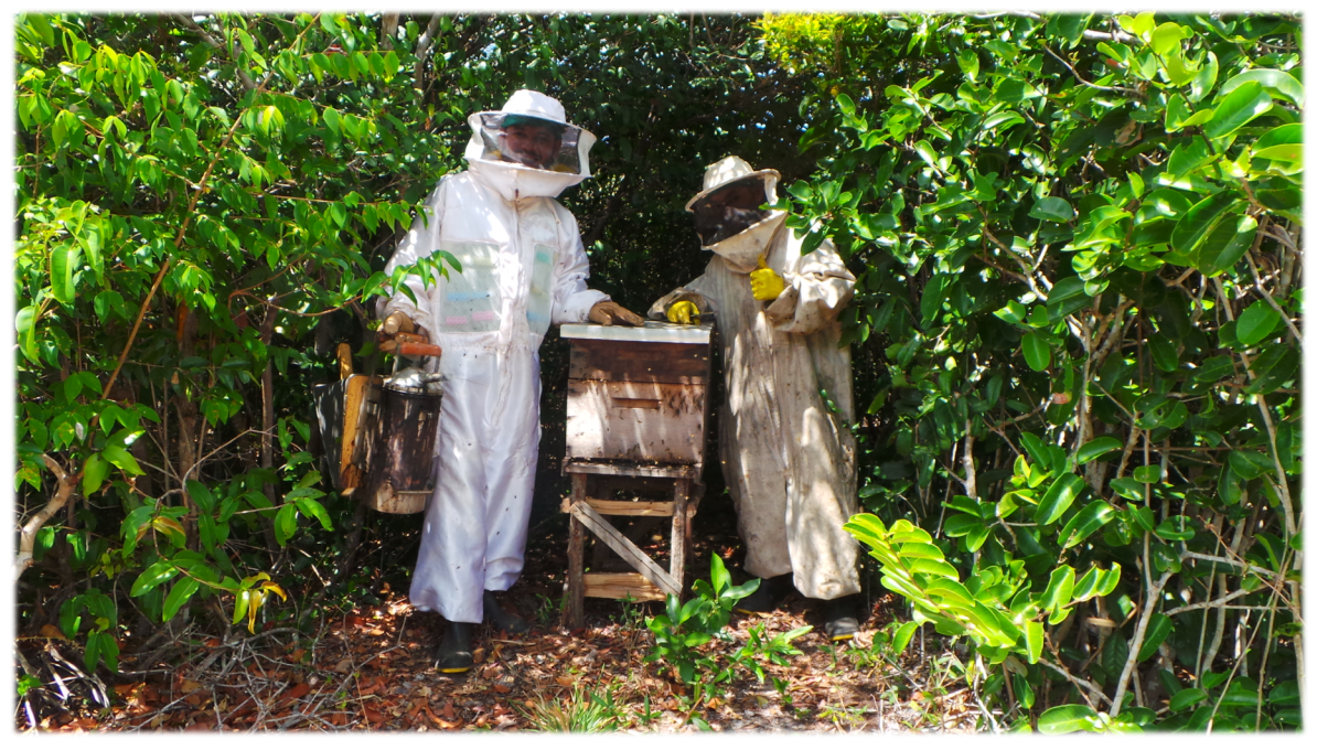
Originally implemented to study neem's effects on bees, our on-site bee colonies have proven that neem pesticides and fertilizers function in harmony with beneficial pollinators such as bees

This is further proof of how neem and neem-based products are harmless to pollinators and are essential for the success of our project.