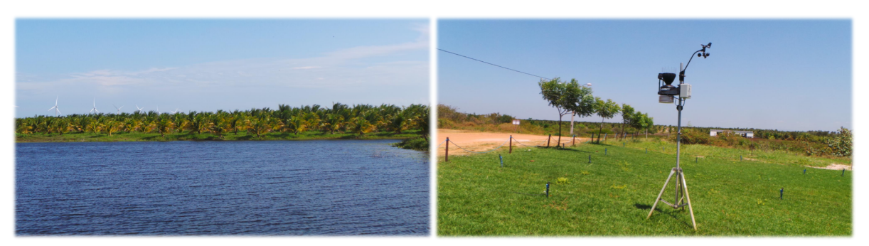
Our eco-dam (left) is an essential resource for sustaining our crops throughout the year. Agrosmart (right) allows us to optimize irrigation and reduce the environmental impact of misuing water

Through the continued implementation of the latest agricultural technologies, we now also have the capability to monitor specific hydrational needs around the farm after the installation of a network of underground sensors. The key use of this technology is to increase irrigational efficiencies. By monitoring the relative hydration levels with Agrosmart, we can directly target dry areas with strategic watering.