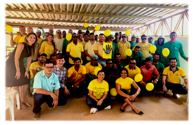
Depression and Suicide Prevention event

part of our commitment As towards the safety and future of our employees, we carry out monthly meetings with our Internal Commission for Accident Prevention (CIPA). This committee consists of three representatives elected by our employees, as well as three representatives elected by the company. During these meetings, which are supervised by a third party, we address topics