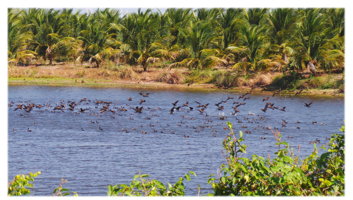
Protected areas are essential to the maintenance of local ecosystems. 20% of all our land has been carefully selected to be left untouched to create refuge for local flora and fauna