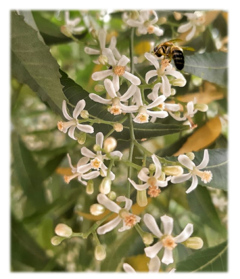
Bees thrive with neem

Neem offers a diverse range of applications across the agricultural sector. Natural and effective, it is an organic alternative for synthetic pesticides that is effective against over 600 species of pests. Biodegradable and non-toxic to mammals and beneficial pollinators, azadirachtin , disrupts the growth cycle of insects and deters them from feeding on plants.