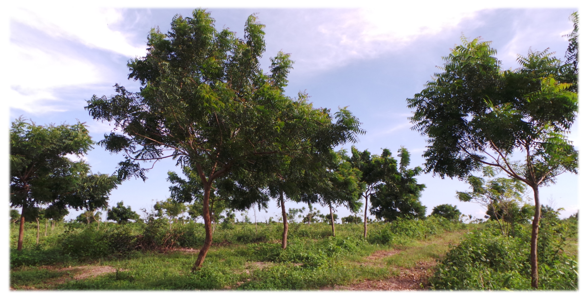
The neem tree offers a viable solution to the global food crisis

For centuries, the neem tree has been known as "The Village Pharmacy" in India, providing hundreds of uses that have ranged from treating diseases to feeding cattle. Today, the tree is being studied for its multiple uses and applications across agriculture, beauty and personal care, healthcare, and environmental protection. The neem tree truly is an agroscientific celebrity and it is not without reason that it has been declared the "Tree of the 21st Century" by the United Nations.