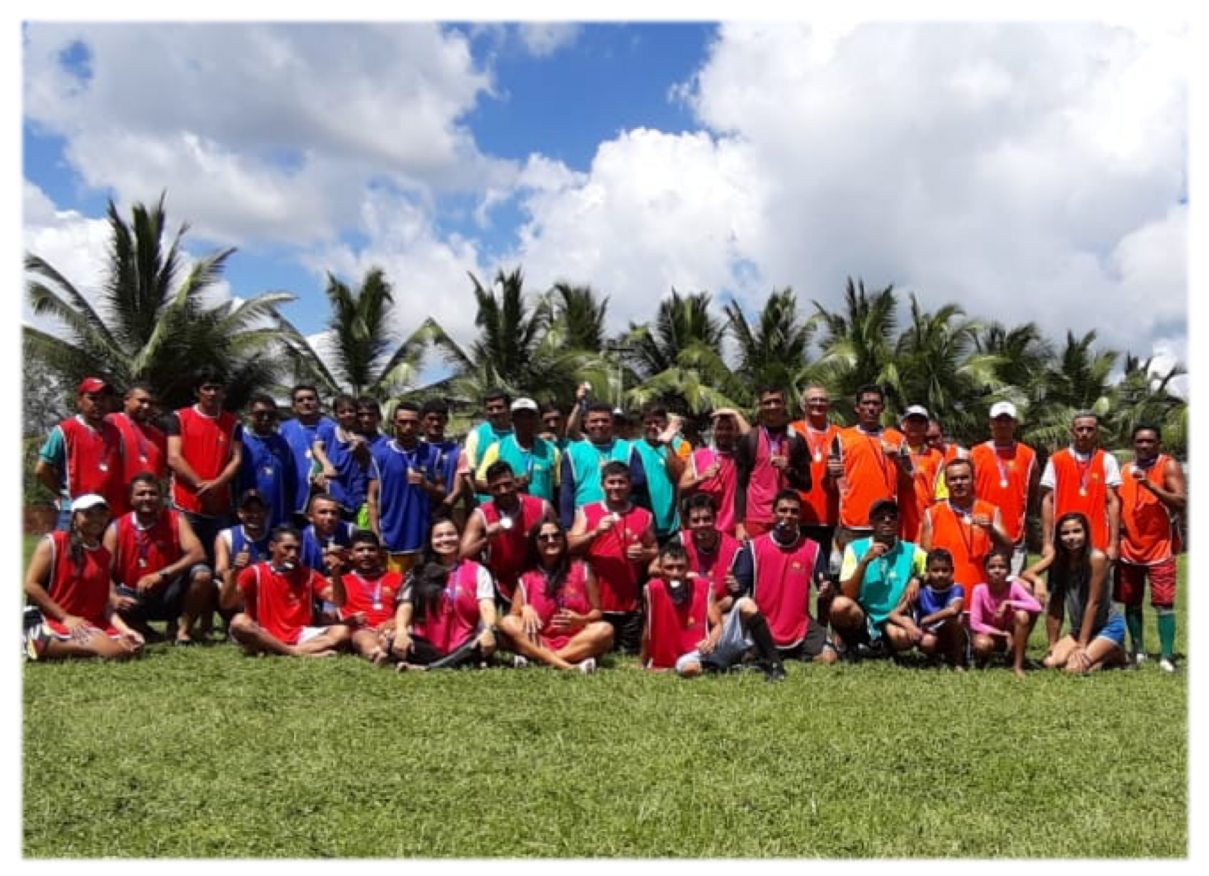
Our employees and their families had a great time at this year's soccer game