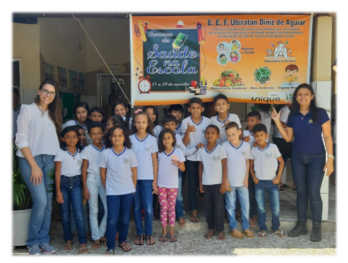
Over 250 children participated in this year's "Health Week" at the local Ubiratan School

Through our Sustainable Future Initiative (SFI) we regularly provide produce to local schools and education on sustainable farming methods. During this year's "Paraiso do Saber" event, we toured 45 kids from a local school