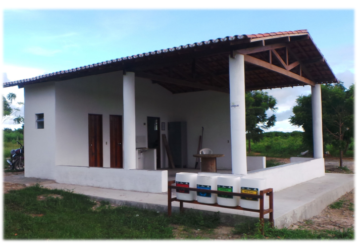
Employees can rest and recover at our new support point

• As part of our commitment to provide our employees with the best working environment, we have constructed new а support point including restroom, storage and dining room facilities, as well as a shaded area, where our employees can rest and recover. We have also worked to improve our pump house and